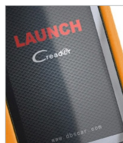
Highlighted 4.0-inch color screen