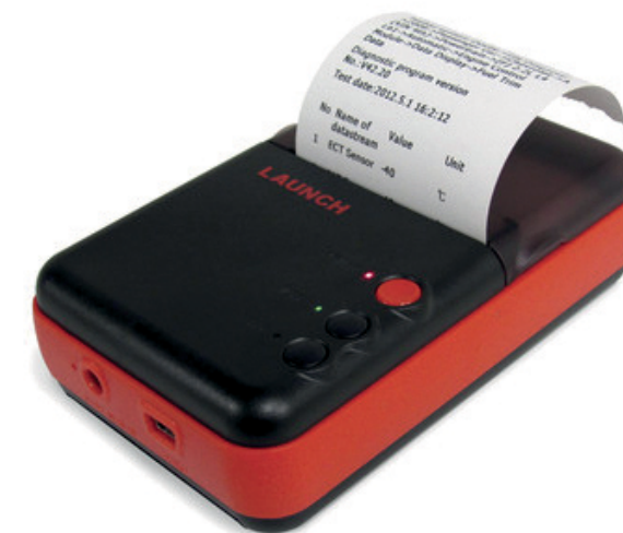
Mini Printer for: X-431 Diagon / Diagon III Wi-Fi Printer for: X-431 PRO / PRO 3 / PAD II

Introducing a sleek and ergonomic printer to go for your Diagon / Diagon III / PRO / PRO 3 / PAD II. Print codes and their definitions, along with Live Data, coding information and relearn procedures – any screen that has a “Print” button can now be printed! It fits right in your pocket and makes printing fast and easy!