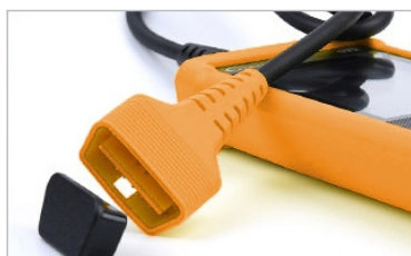
Connector with unique protection design