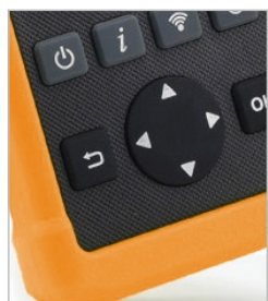
User-friendly shortcut keys