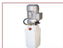
Italian Power Unit