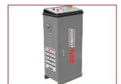
Scissor Lift Straight Control