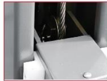
Rack Slope Safety Device

steel cable and locking bar for safe operation