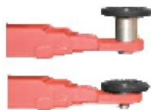
Adjustable Height For Low Profile Car