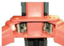
Arm Locking Mechanism