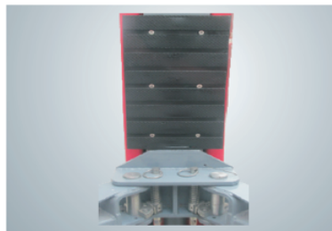
Door rubber pad