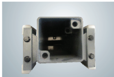
Slider bracket patented designed for easy replacement