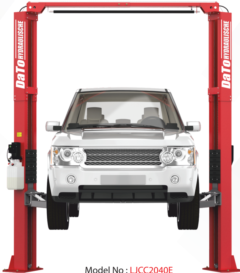
Model No : LJCC2040E

LJCC 2040 E 4 TON TWO POST CLEAR FLOOR LIFT (MANUAL DUAL SIDE UNLOCKING)