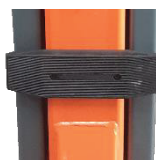
Door Protection Rubber