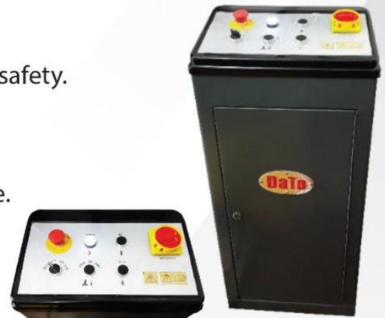
Automatic control pannel with Italian motor