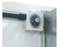
FIRE SHUT OFF