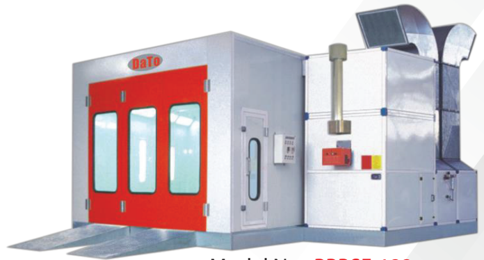
Model No : PBBSF-122