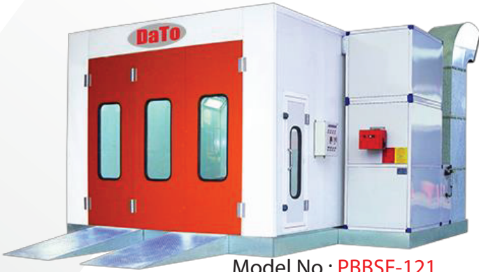
Model No : PBBSF-121

"The Legendary leader of Automotive Equipments"