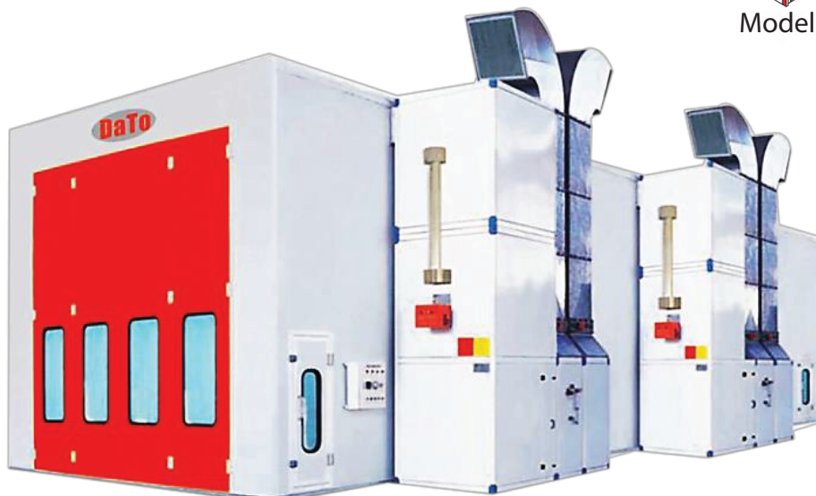
Model No : PBBSF-124