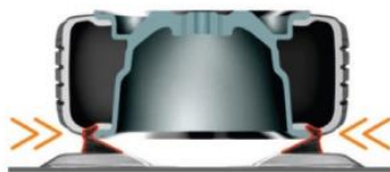
Outside clamping 10~21"