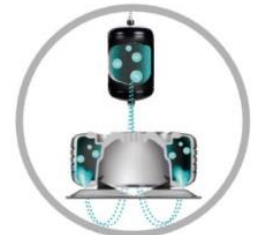
Quick air booster tank