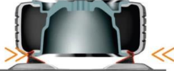
Outside clamping 12~23"