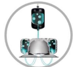
Quick air booster tank

DaTo TCL2613 Tyre Changer is well designed for durability, swift, safe mounting and de-mounting of tyres. This tyre changer is especially designed to handle bigger diameter of tyres and designed with high quality components for better durability.