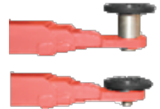
Adjustable Height For Low Profile Car